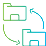
Financial flexibility and control of your money