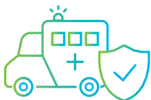
Protection from unexpected health-related costs