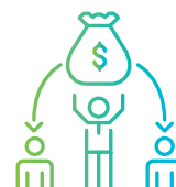
A legacy for your loved ones or favorite charity