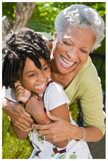
Cash when you need it most, without worry